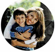
VFW or VFW Auxiliary members

Resident families can accomplish significant life goals by participating in our 1-4 year program